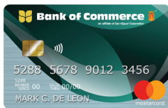
Classic Principal P1,500 Points: 18,750 Code: AMCPN1