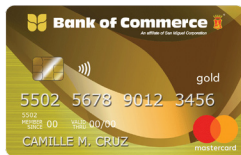
Gold Principal P3,000 Points: 37,500 Code: AMGPN1