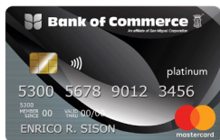
Platinum Supplementary P2,500 Points: 31,250 Code: AMPSN2