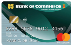
Classic Supplementary P750 Points: 9,375 Code: AMCSN2