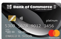
Platinum Principal P5,000 Points: 62,500 Code: AMPPN1