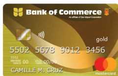
Gold Supplementary P1,500 Points: 18,750 Code: AMGSN2