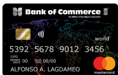
World Supplementary P3,000 Points: 37,500 Code: AMWSN2